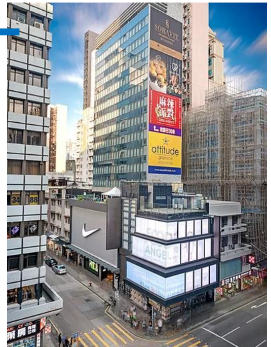
Attitude on Granville Hotel 20 Granville Road, Tsim Sha Tsui