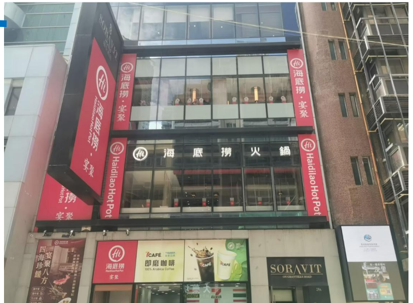
Haidilao Hot Pot Granville Road