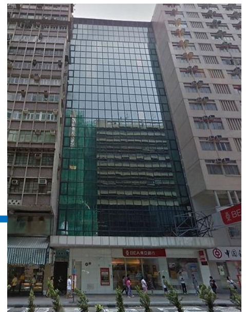
Hanley House 776-778 Nathan Road (Sold)