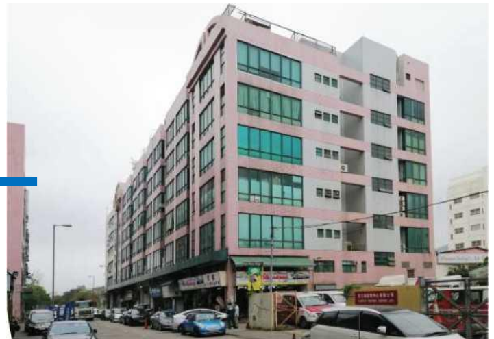
Sun Ling Plaza 30 On Kui Street, Fanling (Sold)