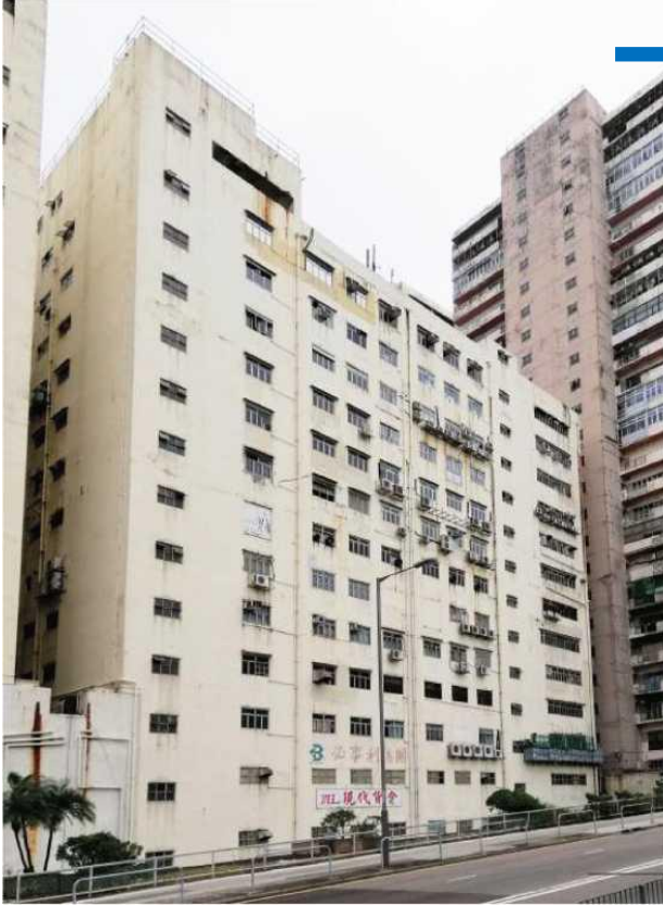
Yee Lim Industrial Centre 2-28 Kwai Lok St, Kwai Chung (Sold)

Tracing back to 1960s and 70s when Carlton first started as a timber trading and traditional furniture manufacturer, there remains some industrial properties and land that used to be operated as factories and sawmills. These land and space has now been turned into warehouses with waivers and licenses leased to different tenants for their operations. Carlton continues to observe for potential opportunities to increase our land bank in different areas and regions in Hong Kong