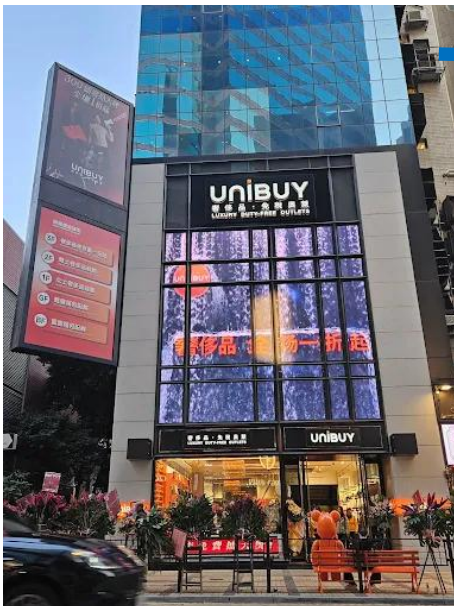
UNIBUY Canton Road