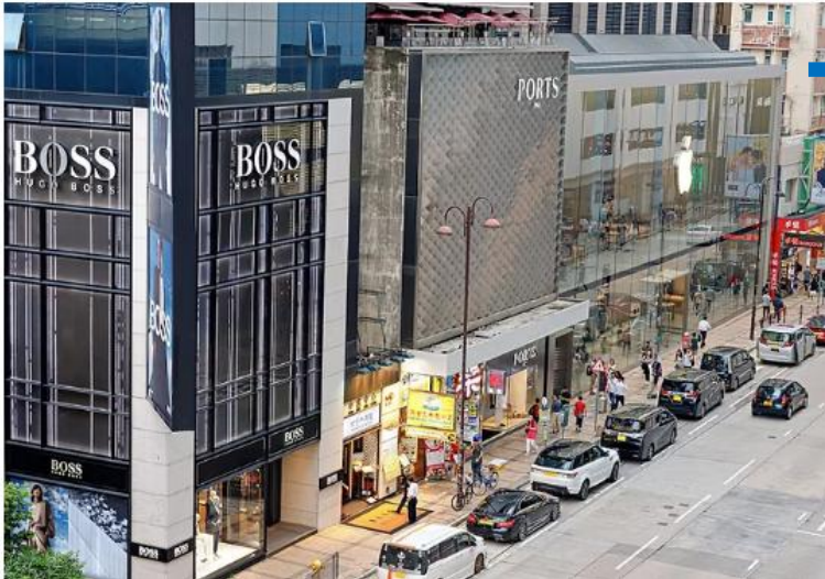
China Hong Kong Centre

Carlton favors prime offices and continues to seek for opportunities to invest further in this particular asset class. The majority of our office units are currently located on Canton Road in Tsim Sha Tsui. Location and accessibility remains our priority when seeking for such opportunities. We are also keen on commercial offices that are part of, or within close proximity to our mixed-used developments.