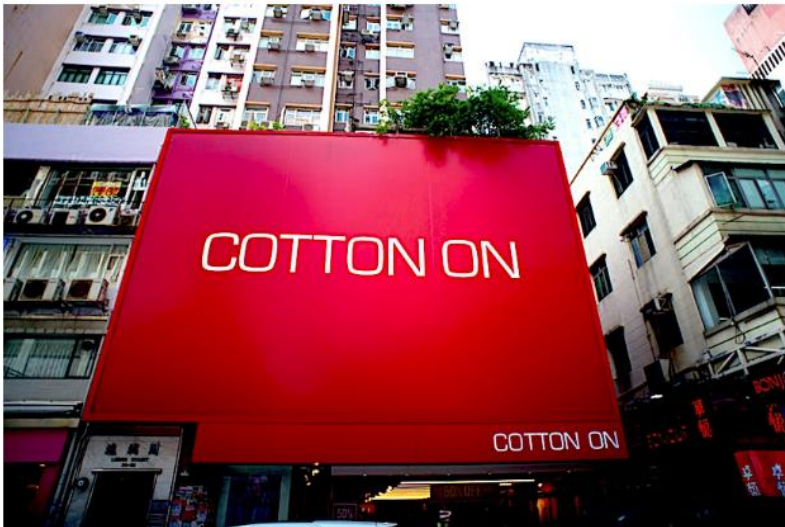
Cotton On Granville Road