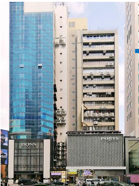
VIP Commercial Centre 116-120 Canton Road, Tsim Sha Tsui