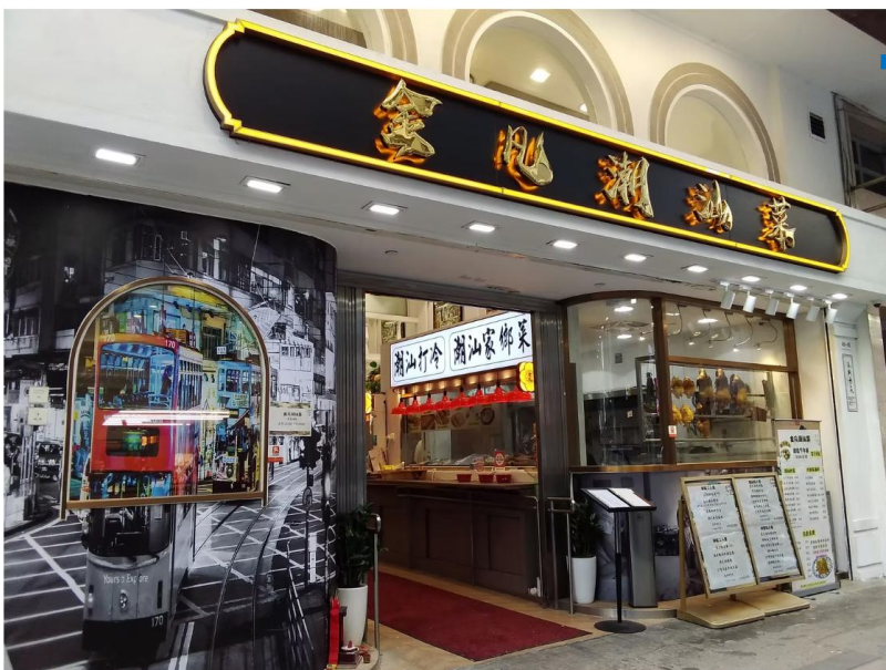
Jinfan Chaozhou Cuisine Granville Road