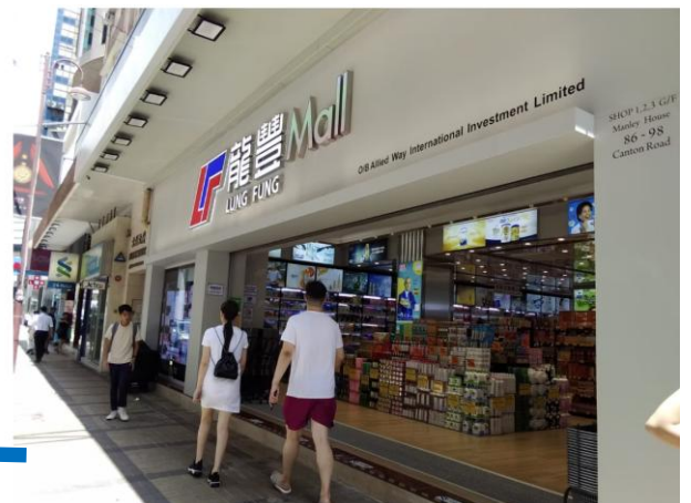
Lung Fung Canton Road