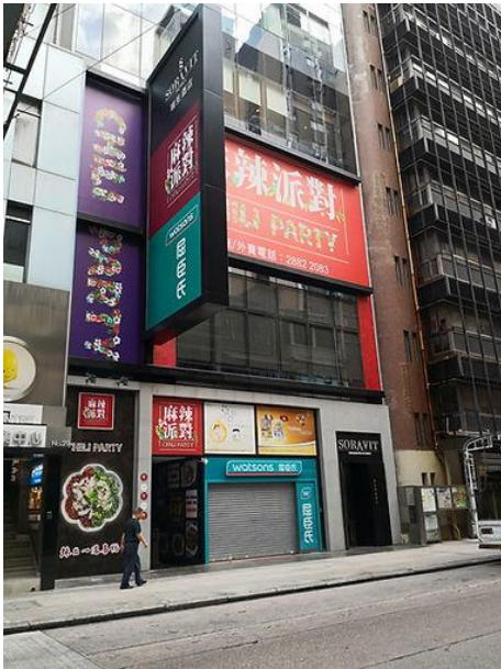
Soravit on Granville Hotel 29A Granville Road, Tsim Sha Tsui